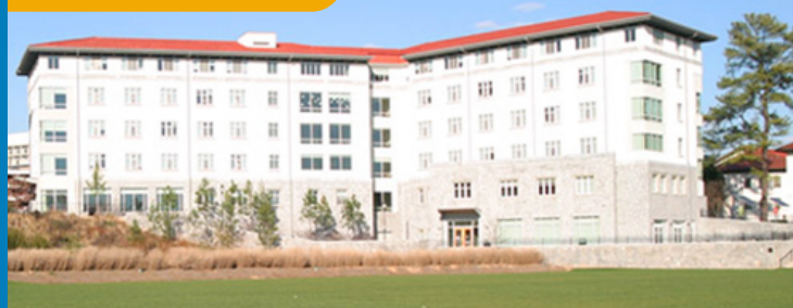
Few Residence Hall

If you are flying from out of town, you must arrange for your own transportation to and from campus. If you need suggestions for the best way for your student to get to campus, please reach out to the camp administrator. If your student is flying as an unaccompanied minor as defined by their airline, please email emorydebateinstitute@gmail.com by May 15th with the student's name and complete flight information. We are not able to provide transportation to campus but can meet your unaccompanied minor per airline requirements at the airport and assist in helping them find their pick-up location.