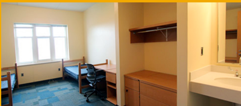
Few Hall room